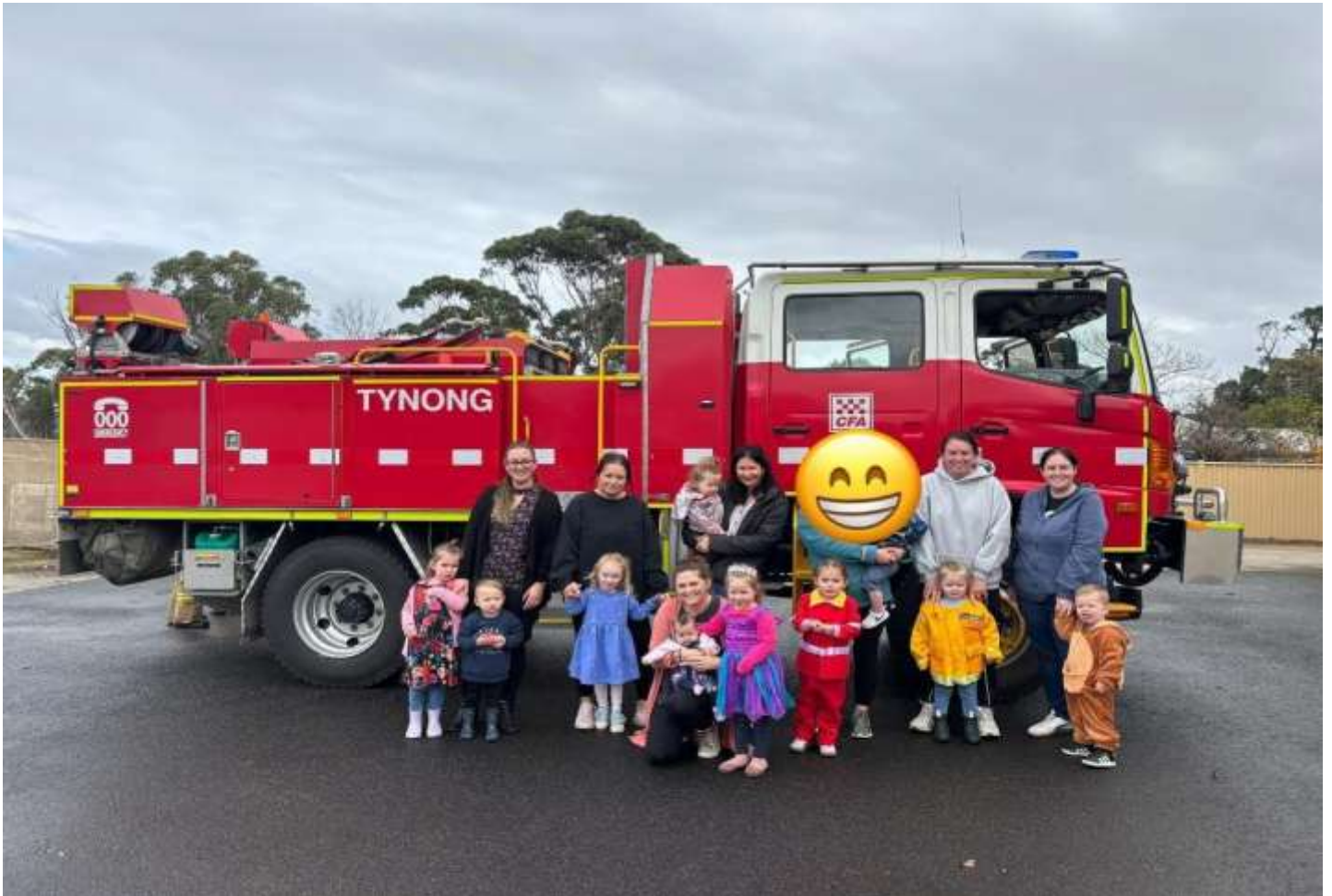
Tynong Playgroup visiting the Fire Station—more inside!

TYNONG PROGRESS ASSOCIATION INC. | Inc. No.: A0035976J | ABN : 69 922 021 580